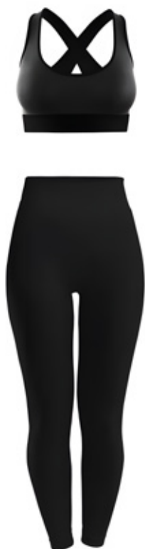
HIGH-WAISTED LEG- GINGS & CROSSBACK SPORTS BRA SET