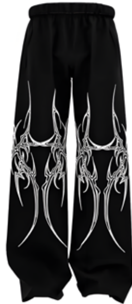
GRAPHIC WIDE-LEG PANTS