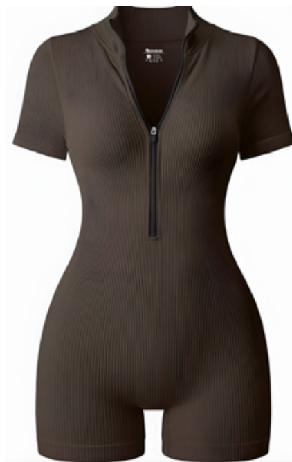
RIBBED SHORT SLEEVE WORKOUT ROMPER