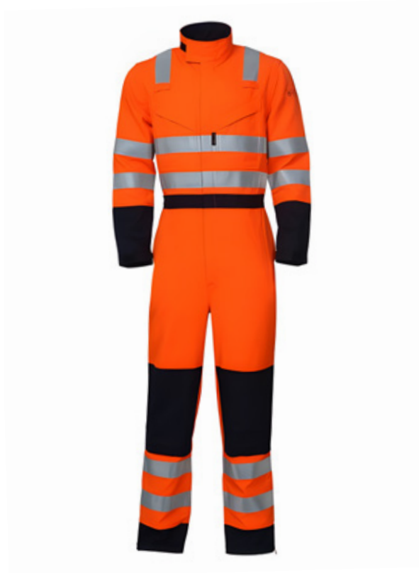
FLAME-RESISTANT (FR) SUIT