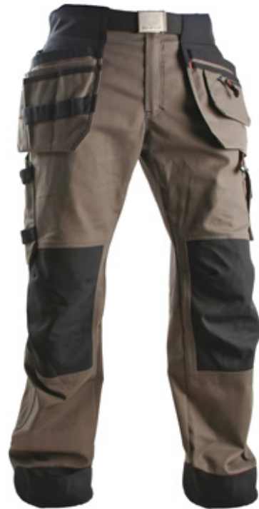
CONSTRUCTION WORK PANTS WITH KNEE POCKETS