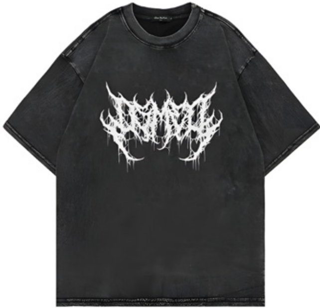
BOXY FIT T-SHIRT